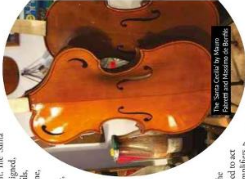
The 'Santa Cecilia' by Mauro Fabretti and Massimo de Bonifis

Fabretti says that the two upper 'lungs' of the instrument are intended to act 'in a certain sense as amplifiers, and as independently as possible with respect to the two lower lungs that are set in vibration by the soundpost placed under the bridge. The aim is to provide a wider and more nuanced harmonic range.' As with other ergonomic violas, the upper treble side of the 'Santa Cecilia' has been lowered to favour left-hand playability, but the geometry of the lowered side in this instance derives directly from Fibonacci's 'golden ratio'.